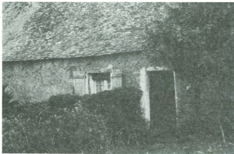
The back of the cottage

« THE TIME OF CRIMES HAS BEGUN... THE DEVIL WILL APPEAR IN THE FORM OF LIVING APPARITIONS... WOE TO THOSE WHO DARE TO MAKE PACTS WITH THESE PERSONAGES WHO APPEAR IN