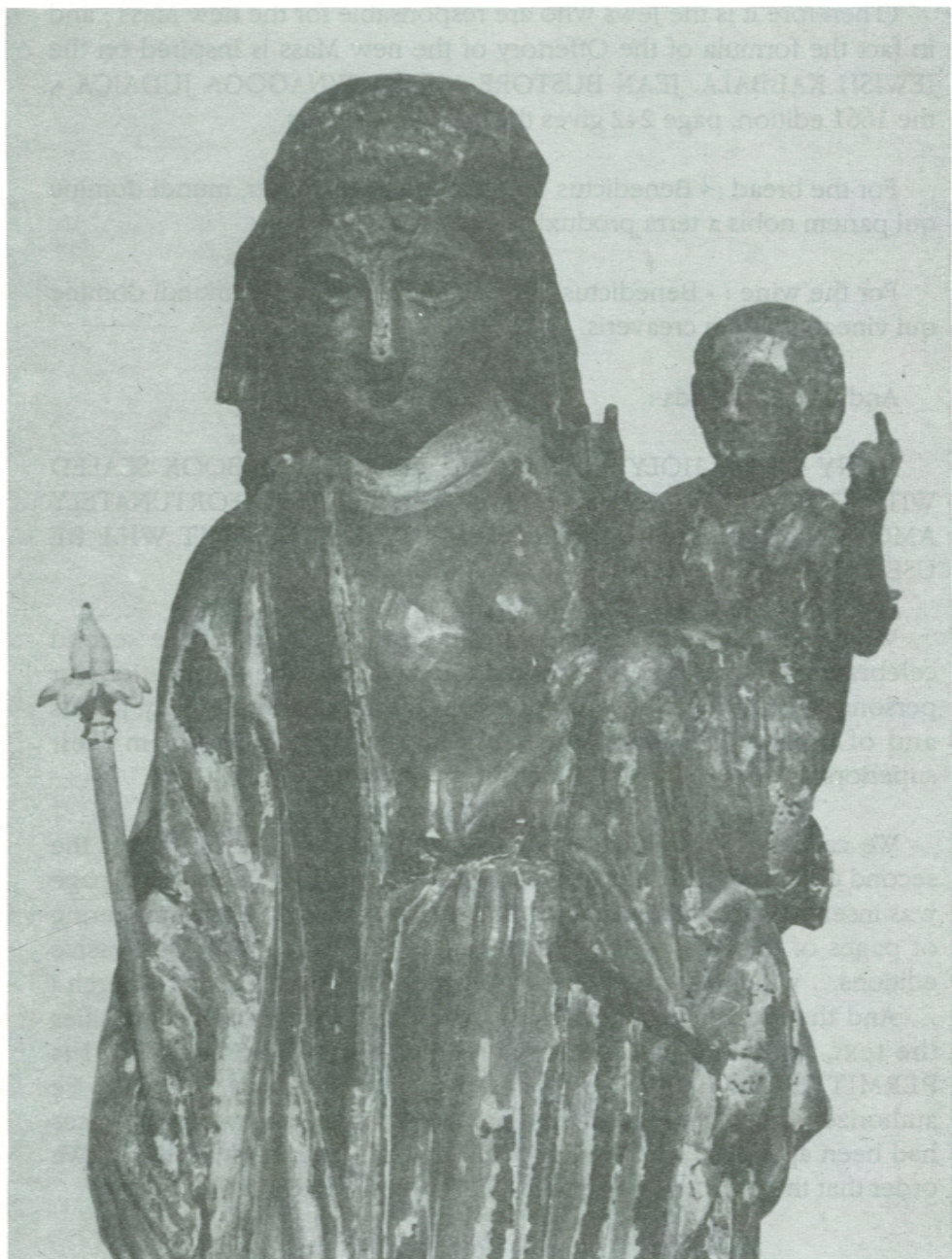
The miraculous statue of Our Lady of Bonne Garde