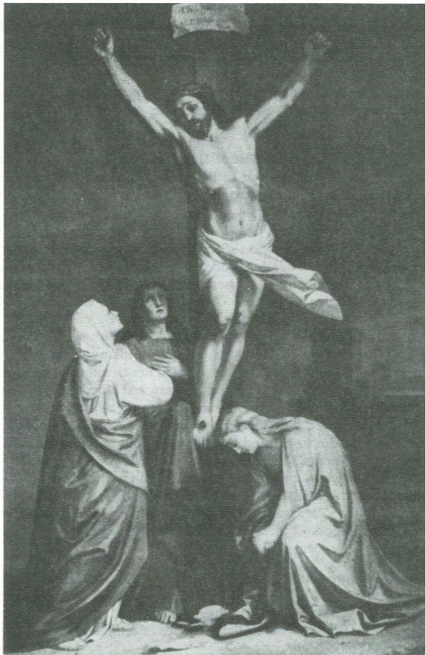
The picture of Calvary which bled