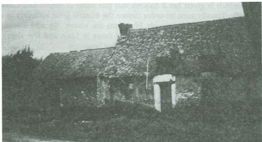
The front of the cottage